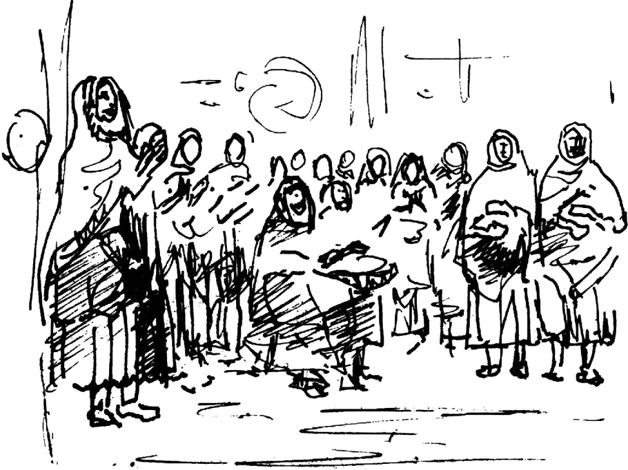
Fig. 1. Harari women perform gey fāqār in a drawing by Kabir Abdulmuheimen.

became particularly intense during the last century. Presently, Harari men have abandoned secular songs, eventually opting for religious chanting ( zikri ), while a young generation of pop singers ( fennan ) started performing on stage newly arranged Harari repertoires; in these circumstances, traditional forms of gey fāqār keep being performed, within the city walls, mainly by mature women, whose custodianship turned into the key of preservation, transmission and development of musical and poetical performance. (9)